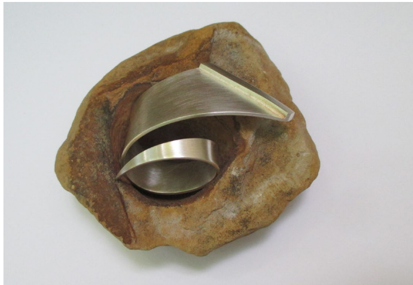
Sandstone and Sterling Sculpture Dena Hawes